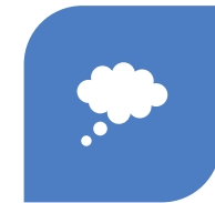
NARRATIVE REFLECTIVE WRITING